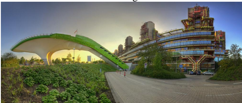
University Hospital at Aachen

Lindlar Visit 2019, 2 nd to 6 th May - Twenty one members boarded the coach at 7am on Thursday and travelled via the channel Tunnel, arriving in Lindlar at 8:30pm local time. We were warmly welcomed by our hosts as always and enjoyed the comfort of their homes for the first evening.